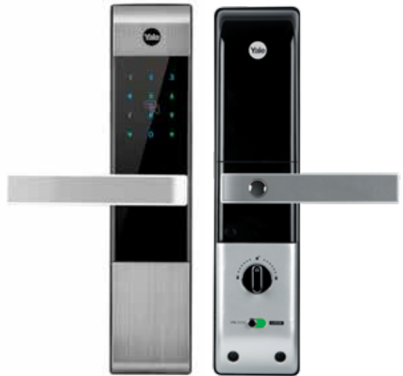
YDM3109 (Silver) Front Body 27(D)X68.6(W)X306.6(H) mm Back Body 37(D)X72.8(W)X306.6(H) mm