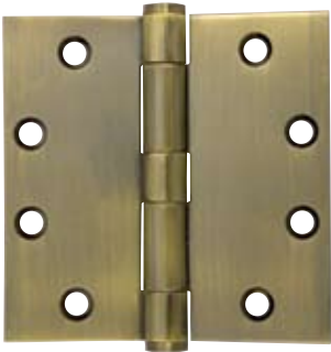
[ Finish : ABSS ]