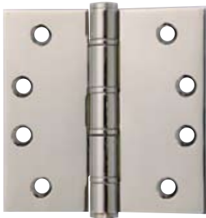
[ Finish : PBSS ]